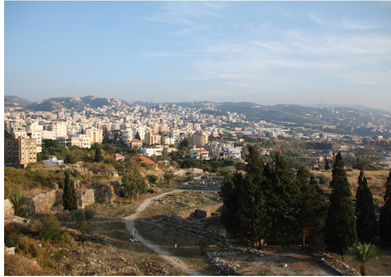
Byblos Historical Citadel