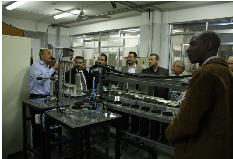
Study visit to the Higher Industrial Technical Institute in Dekwaneh