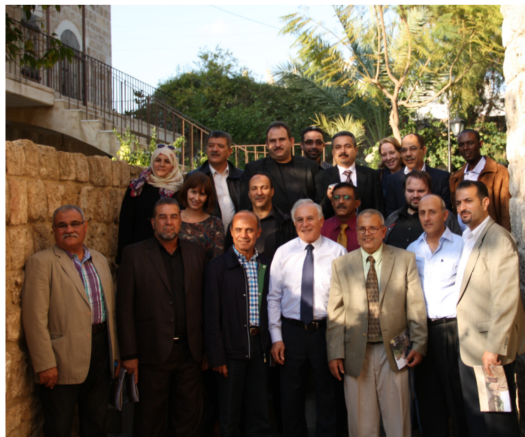
Participants during study visit at the ICHS Byblos