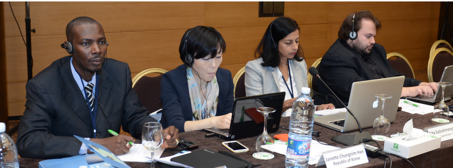
Participants from Nigeria, Republic of Korea, United Kingdom, and Germany

In relation to greening TVET projects, Mr Muhammad highlighted the key initiatives, such as the development of a renewable energy curriculum (in meetings held on 15–21 December 2013 and 19–25 January 2014) and green campus capacity-building, which encourages the adoption of green technology on campus, with an emphasis on sustainable energy and waste management.