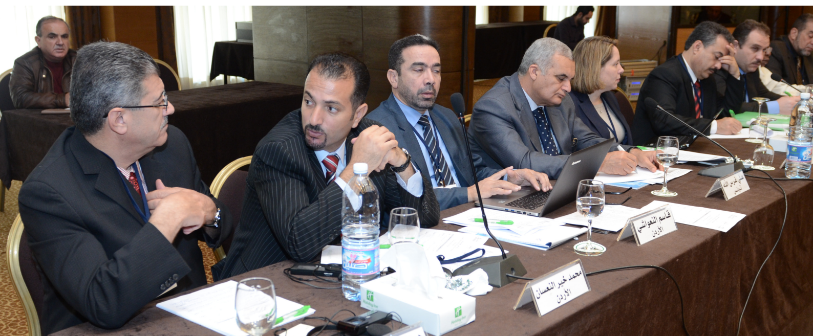
Participants during discussion round