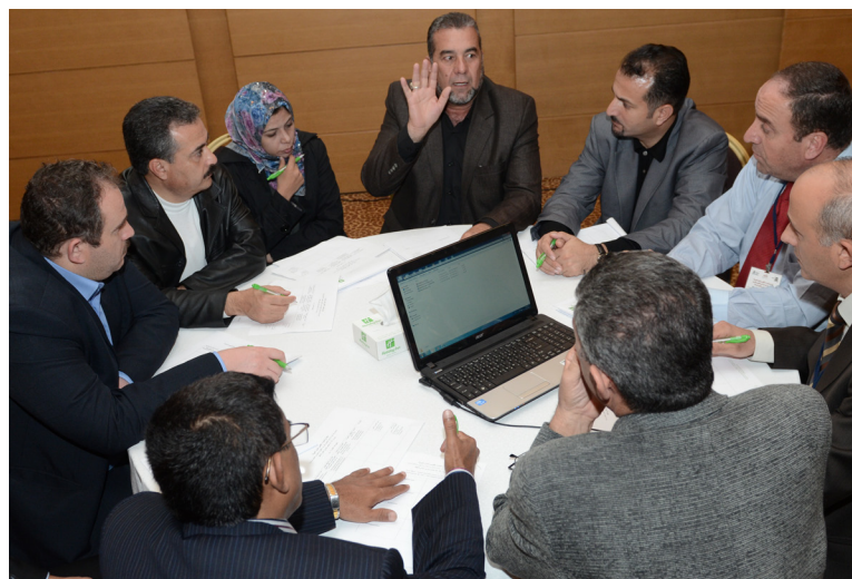
Participants during working group sessions

Qualification requirements for TVET teachers in Arab countries should correspond to real needs, and teachers in entrepreneurship should receive enough practical training. At present, the requirements focus